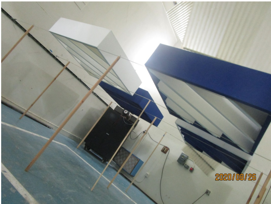
Figure 2 – Underside of specimen in test chamber